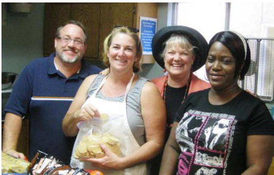
Our Faithful MAD Friday Kitchen Crew Volunteers!